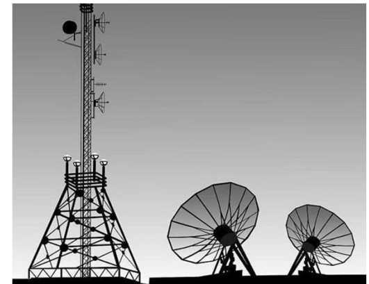
Greater Flexibility in Constituent Communications