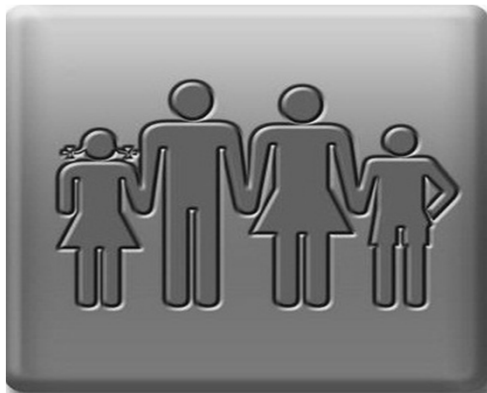
Enhanced Constituent Relationships